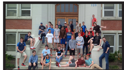
TOP SCHOOL - BCI $800